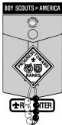
CUB SCOUT RIGHT POCKET

Conduct uniform inspections with common sense; the basic rule is neatness.