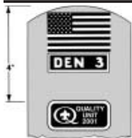
CUB SCOUT OR WEBELOS SCOUT RIGHT SLEEVE