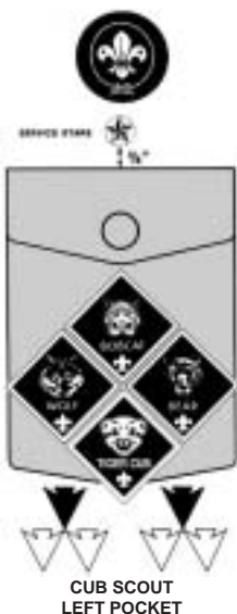
CUB SCOUT LEFT POCKET