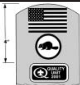
WEBELOS SCOUT RIGHT SLEEVE